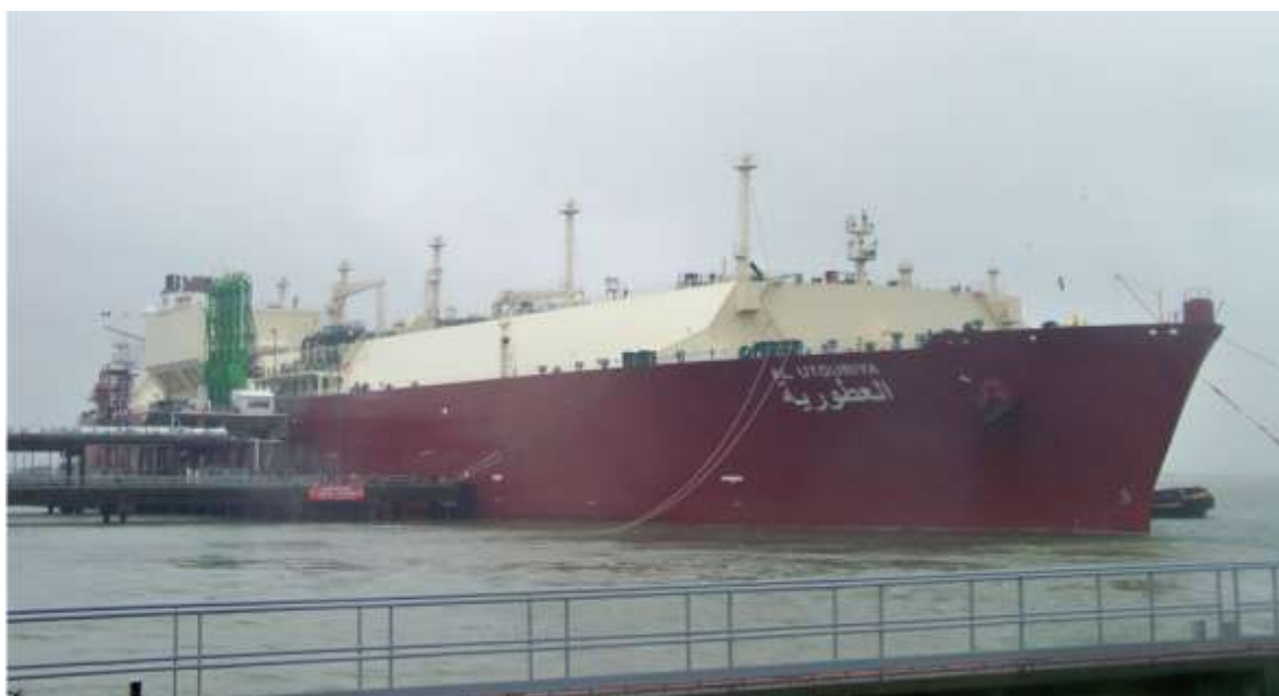
Al Utourya: 1 st Qflex type vessel received at Montoir - November 2009

Montoir location and its ability to receive very different LNG qualities and LNG carriers, including the very largest (up to Qmax vessels), ensures that Montoir-de-Bretagne has among the highest utilisation rates (> 60 %).